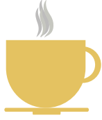
cup of hot chocolate